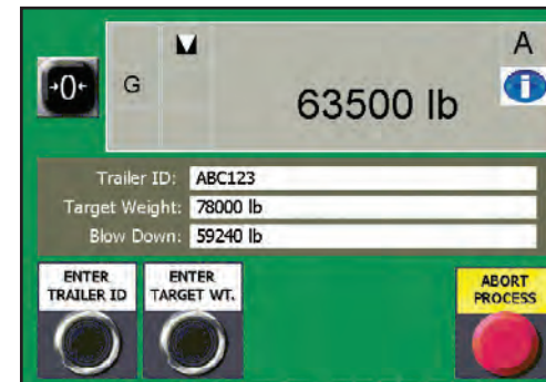
B-TEK attended truck In/Out software