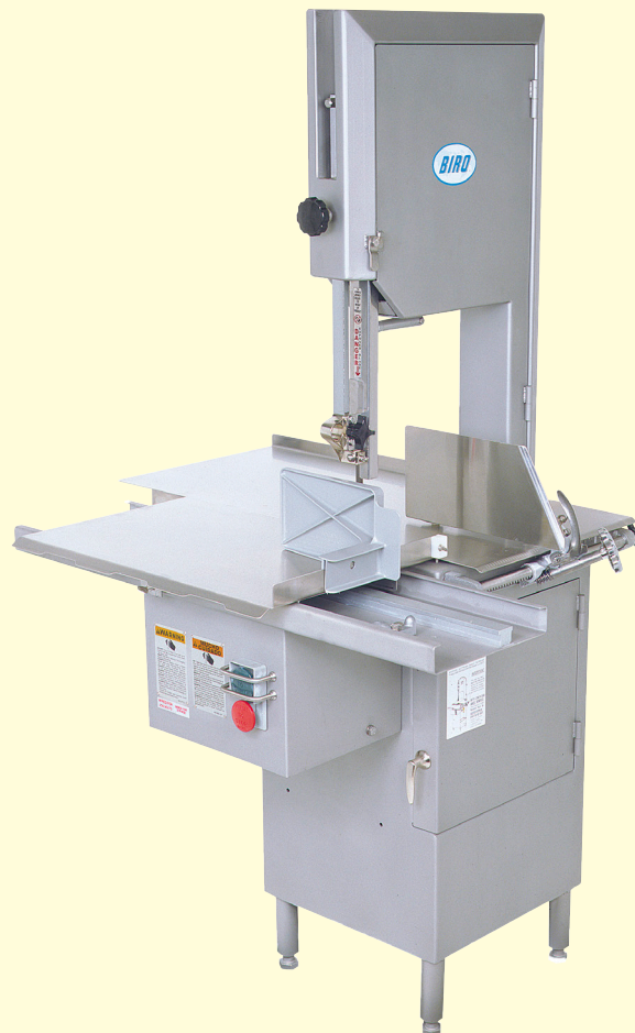
Model 1433FH (Fixed head structure) Right to left feed.