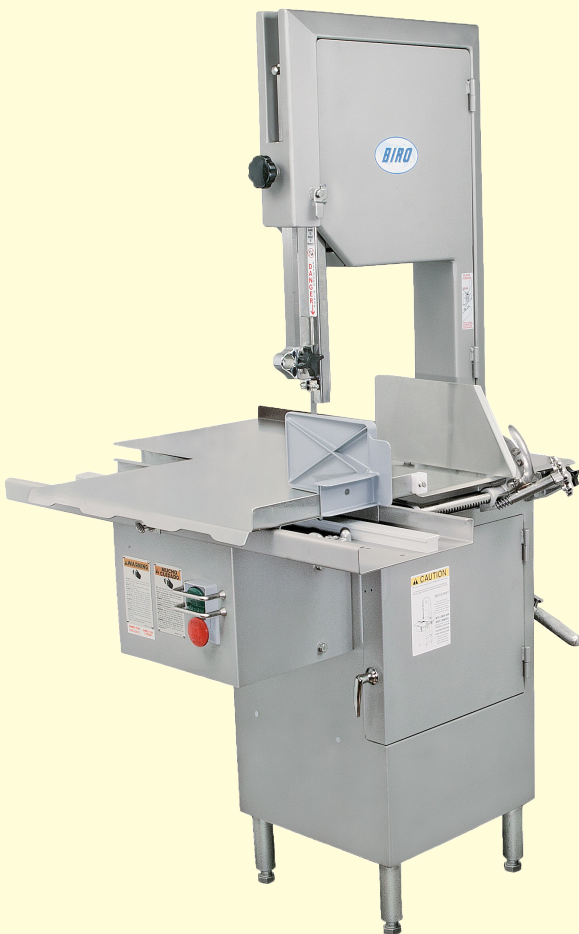
Model 1433 (Movable head structure) Right to left feed.

The BIRO Models 1433 and 1433FH (Fixed Head) Meat Cutters are compact production saws that are perfect for today's meat room. The 3HP, totally enclosed motors and 3550 feet per minute blade speed (higher speed available at no charge) provide you with the power you need. BIRO's exclusive EZ-flow meat carriage helps reduce operator fatigue and increase productivity. Both Model 1433's feature a watertight magnetic starter with thermal overload protection, removable lower wheel, and double V-belt pulley drive system. Both models also incorporate the superior design and engineering you've come to expect from BIRO, which means you'll get many years of use, minimal maintenance, and lower overall cost of ownership.