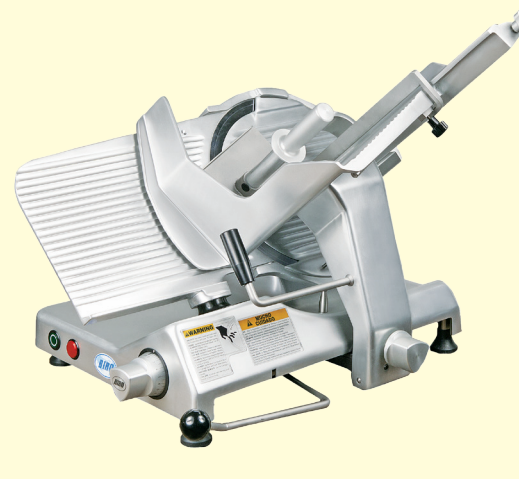
MODEL B350M (Detachable Sharpener Shown Reverse Side)