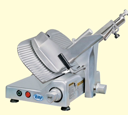
MODEL B300M (Detachable Sharpener Shown Reverse Side)

Built in Safety Features – Blade protective ring guard prevents exposed blade edge when the blade cover is removed for cleaning. Product table lockout prevents thickness gauge from being opened during cleaning. Emergency shut-off and thermal overload/no volt release prevents accidental turn on after power outages. Remote sharpener mounts easily when needed, but is stored away from the slicer when not in use providing added hygiene security to the slicing operation.